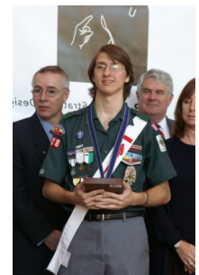
Outstanding Scouting youth receiving The Young American Award